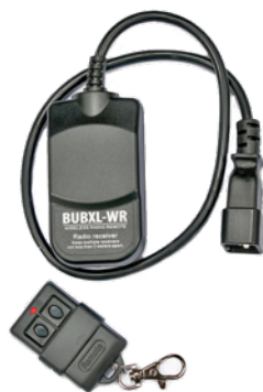
Wireless Remote SKU: BUBXL-WR