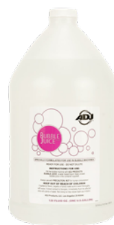
Bubble Juice (1 Gallon) SKU: BUB/G

Additional parts and accessories available at www.adj.com